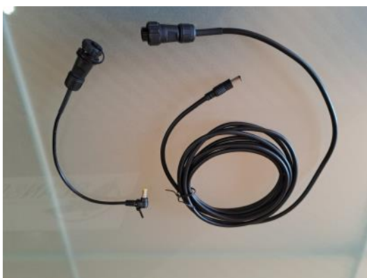
Cable kit for BLK ARC

Bracket for BLK ARC with adapters for 5/8" female and 3/8" female